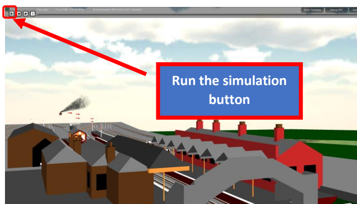
Figure 3: View showing train

On this view you can see the train in the distance. Only one tile is shown in Version 0.1 so the train floats in the air!!